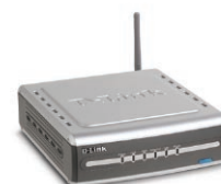
DSM-G600 Wireless Network Storage Enclosure